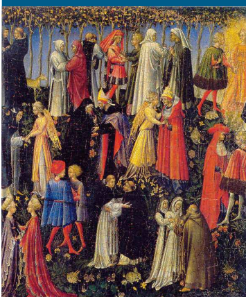
Paradise, Giovanni di Paolo

pear trivial or superficial when placed against some of the important questions asked during the middle ages and renaissance about salvation. Yet for those struggling to understand and explain the relationship between the mortal and immortal worlds, dress represented a means through which people could be rewarded or punished after death. It is these uses of clothing and adornment which are the main focus of the project.