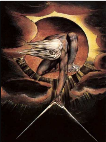
Ancient of Days, Wm Blake