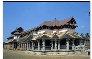
Jaina Temple at Mudabidri, Karnataka

This project presents this intriguing and so far widely neglected period in the history of south India for the first in a more holistic and complete way.